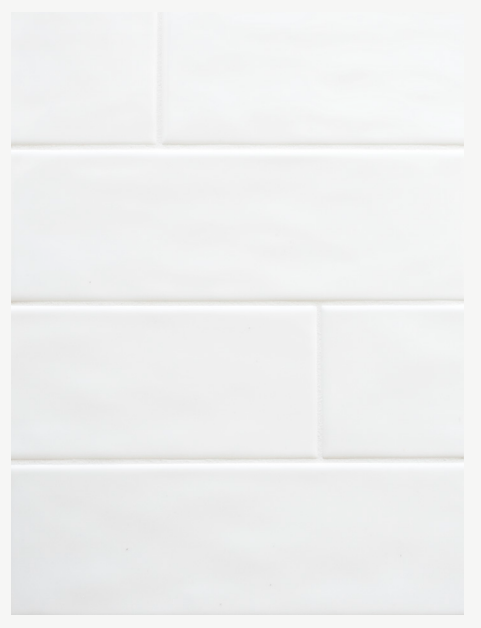
Cloud (LAAA541) Also available in Matte Cloud (LAAA236)