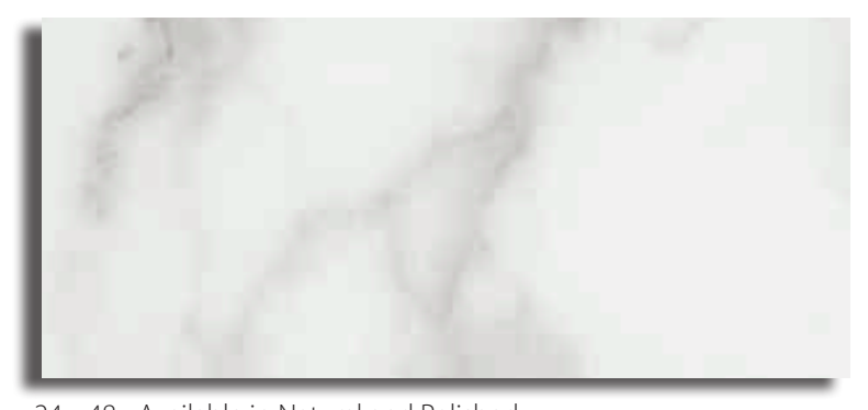
24 x 48 - Available in Natural and Polished