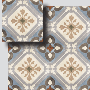
Palazzo Ducale B ESDEPD/88B