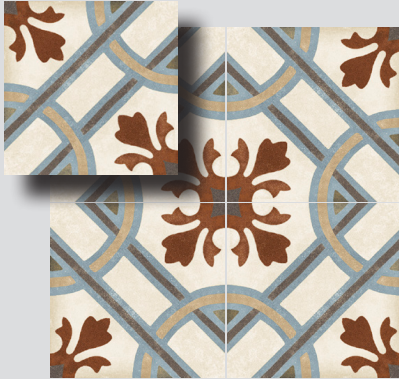
Palazzo Ducale A ESDEPD/88A