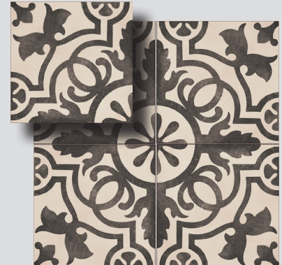
Black & White X ESDEBW/88X