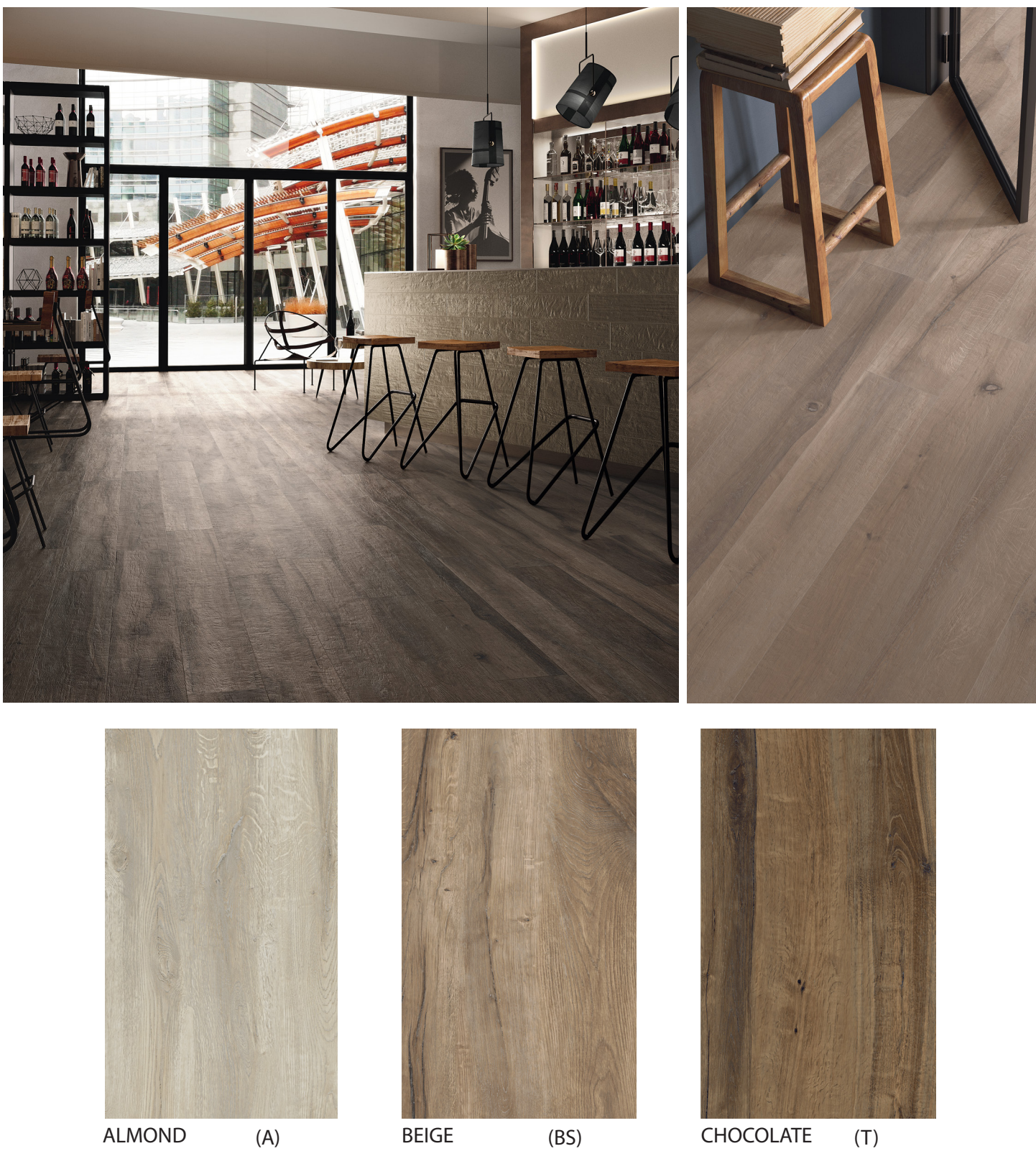
Colors are intended as a guide only and may vary from actual tile. Sizes listed are nominal. Please check samples before making final selection and to get actual dimensions for layout. See reverse side for additional product information.

With Kuni, Imola has painstakingly recreated wood planks that have been worn over time. The realistic surface structure and natural color palette create a warm and inviting wood look.