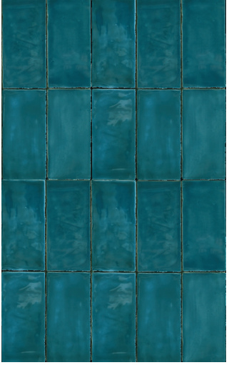
Blu di Prussia (SAMEBP)