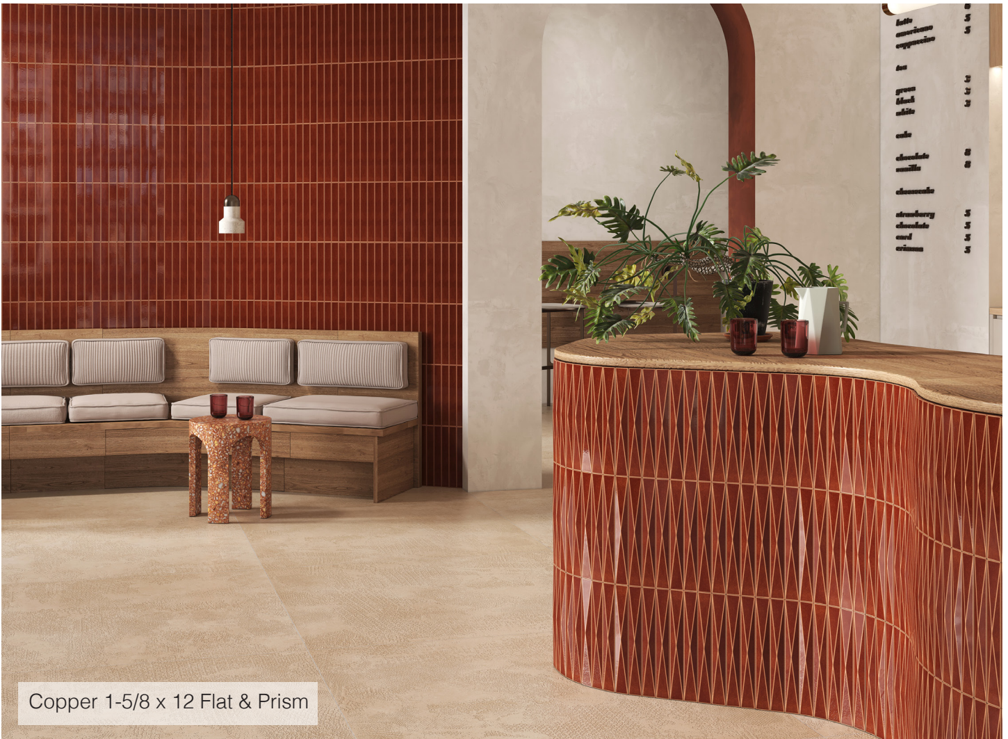
Copper 1-5/8 x 12 Flat & Prism

Colors are intended as a guide only and may vary from actual tile. Sizes listed are nominal. Please check samples before making final selection and to get actual dimensions for layout. See reverse side for additional product information.