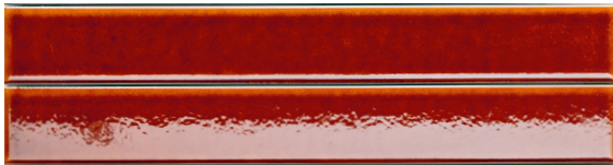
Copper 1-5/8 x 12 Prism (SAPECR/212P)