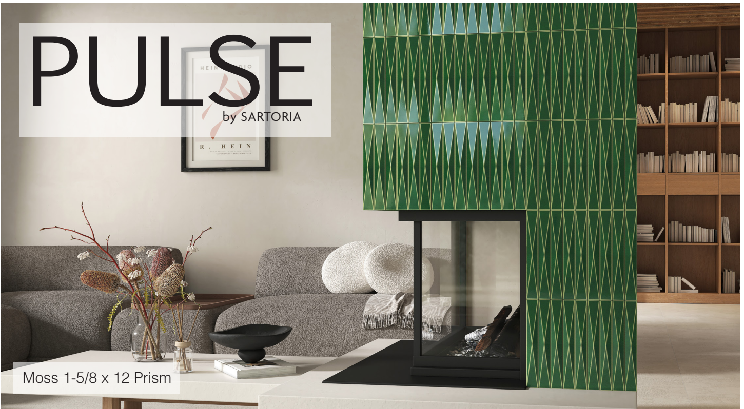
Moss 1-5/8 x 12 Prism