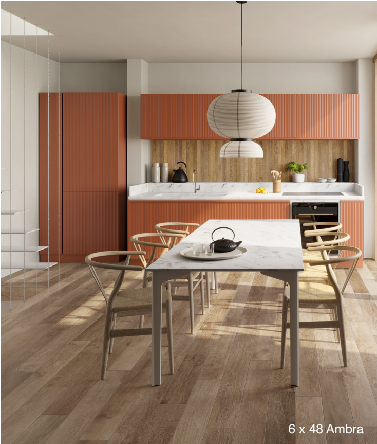
6 x 48 Ambra

Shizen is a new generation of wood-look porcelains. By using the 3D technology, Edimax gives maximum realism to the product by creating a tactile wood grain surface. With its color palette comprised of 4 warm tones — from the soft, golden hues of the Miele color to the dark, velvety brown of Torba — this material can be used to create inviting and cozy spaces. The 6 x 48 size also adds to the realism of this line as the thinner planks create more variation. There is also 32 x 32 Cassettone in a parquet look available in Ambra and Miele colors.