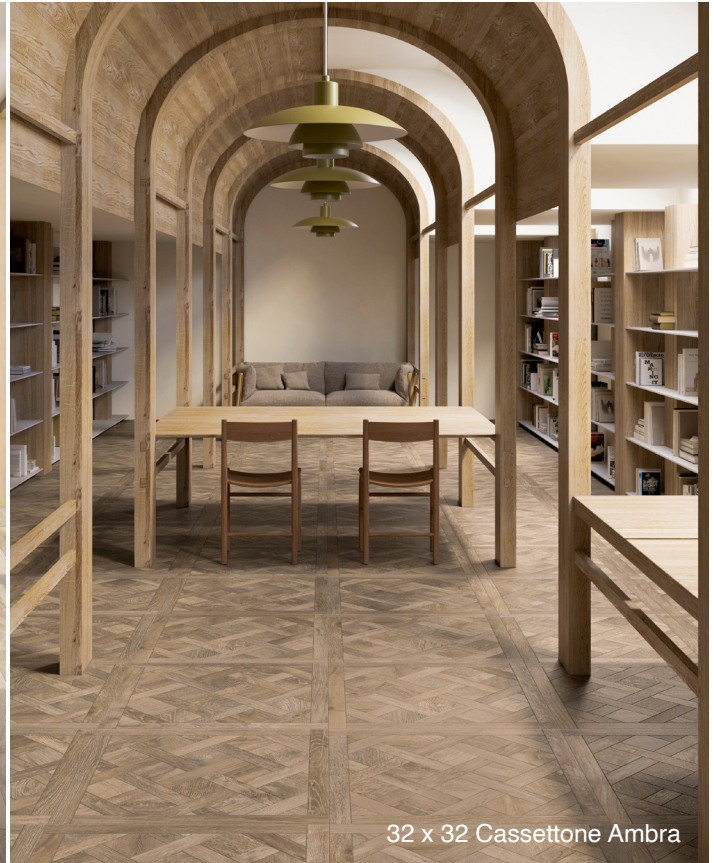
32 x 32 Cassettone Ambra