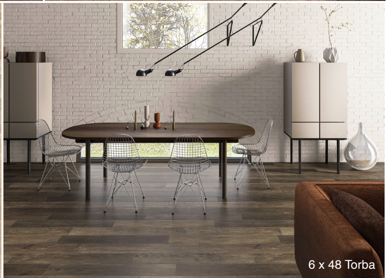
6 x 48 Torba

Colors are intended as a guide only and may vary from actual tile. Sizes listed are nominal. Please check samples before making final selection and to get actual dimensions for layout. See reverse side for additional product information.