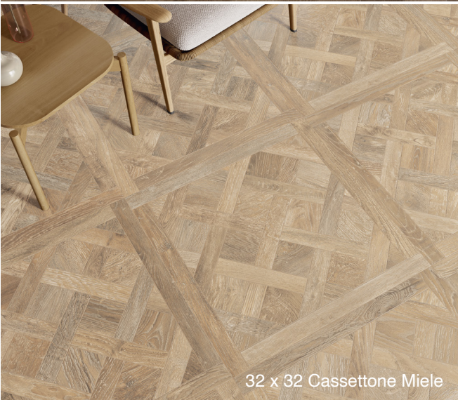
32 x 32 Cassettone Miele