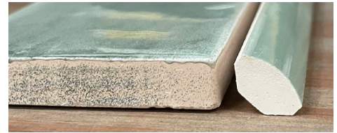
1/2 x 12-3/4 SBN (Pencil Bullnose/Jolly) with field tile.