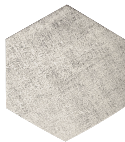
8 ½" Hex (MCTE--/9HX) Non-Rectified