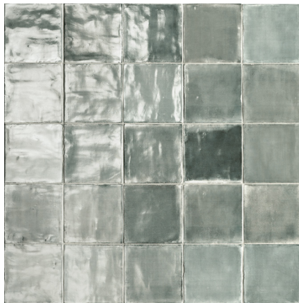
Fresh Thyme (SATSF5)