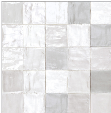
Half Moon (SATSHM)