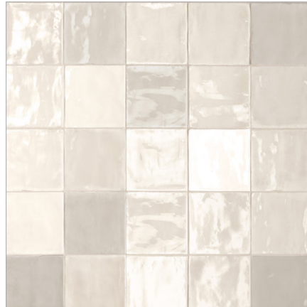
Pure Linen (SATSP5)