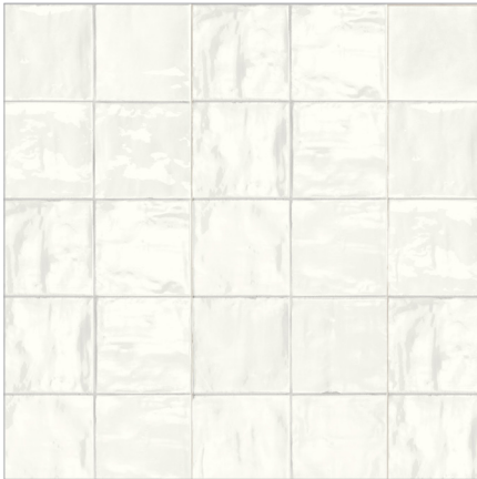
First Snow (SATSF5)

The 6 x 6 wall tile offers a handcrafted look reminiscent of the “zellijes” tiles made by hand in Morocco. While all the colors have shade variation, some have more movement than others. All the colors are made on a bisque with an uneven surface structure and irregular edges that are slightly chiseled. These characteristics are intentional and add to the hand-made appearance.