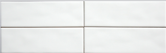
Glacier (Glossy) (LAWE200)

Windermere combines a gently undulated surface with exquisite glazes to create a final look that is opulent and full of depth. The 2 Whites - Glacier (Glossy) and Chalk (Matte) - are opaque and allow the surface structure to take center stage, creating a look that is more interesting than a flat white tile. The other 6 colors have translucent glazes that create variation as they pool on the surface and vary in shade from piece to piece. In addition to the 3x9 size, there is the Diamondback Mosaic made from oblong hexagonal pieces with a three dimensional surface; each piece has an off-centered point that creates lines and shading as the translucent glazes pool on the surface. The pieces are then mounted randomly to create the distinctive Diamondback pattern. They make a stunning accent but are even more exciting if used in entire areas.