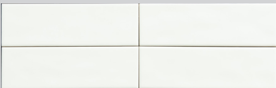
Chalk (Matte) (LAWE201)

Colors are intended as a guide only and may vary from actual tile. Sizes listed are nominal. Please check samples before making final selection and to get actual dimensions for layout.